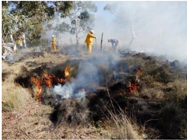
Upper Shoalhaven Landcare's Healing Country and Community with Good Fire Practices

Read these inspiring stories on how our communities are taking action now: https://bit.ly/3eZnSys